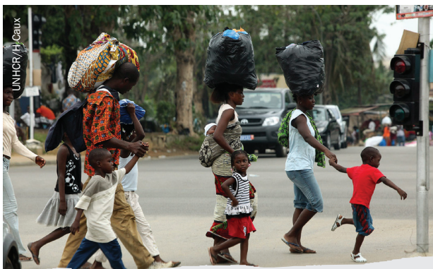
A family hurries away from the Abobo neighbourhood in search of safety during political unrest in Abidjan, Côte d'Ivoire, 2011.

Lucy Hovil (International Refugee Rights Initiative) www.fmreview.org/preventing/hovil