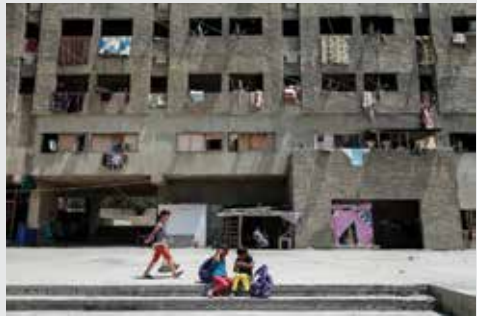
Housing for Syrian refugees, who are being supported by CARE International Lebanon.

So how did we decide what image to use on the front cover of this issue? We wanted to avoid the classic image of the destitute refugee living in a makeshift twig shelter covered in rags and bits of plastic – although for some people such shelters are still their only option. And yet the neat prefabs springing up in various locations around the world are also not the reality for most IDPs and refugees. In the end we decided to reflect the fact that over recent years displaced people increasingly find their own shelter, particularly in urban areas, where their comparative invisibility may be both an asset and a risk.