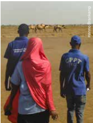
CPPTs on patrol in Kakuma refugee camp.