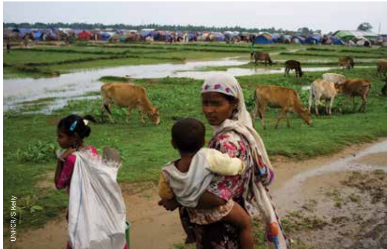
IDPs in Rakhine State, Myanmar. The site is home to thousands of Muslim IDPs who were forced to flee from their homes when inter-communal violence in 2012 displaced up to 140,000 people.

Decision making: There is a need to find better ways to include local agencies in the international architecture at global and local levels. The way national NGOs are included in Humanitarian Country Teams is not sustainable owing to the imbalance in