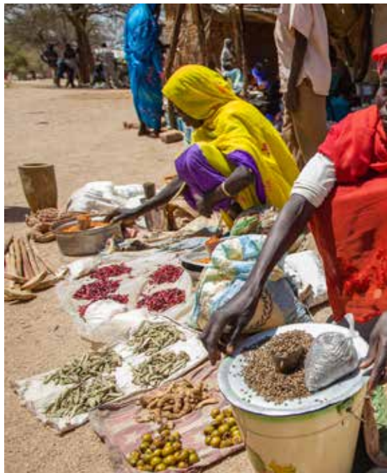
Women at market in South Kordofan, with foxhole behind them.

Performing such important, life-saving roles in the community earned the women greater respect among a range of local stakeholders (mosques, community leaders, armed groups, etc). This gave the women the status and a platform from which they have been able to begin addressing more sensitive and challenging issues – such as gender-based violence – within the community. When considering the impact that the work of local organisations in the Nuba Mountains has had, international actors would do well to consider how best they can support such community-led protection