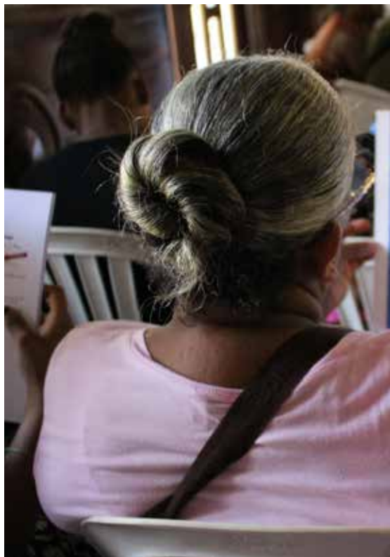
Training in disaster risk reduction and management, San Cristóbal.

that, when combined with the underlying conditions of extreme inequality and widespread impoverishment, result all too often in disaster. Among the most significant recent examples are Hurricane George in 1998, which left over 85,000 internally displaced and 350 dead; the Jimaní flash flooding in 2004, which erased several communities from the map and left over 600 dead and around 1,000 families displaced; and, in 2007, tropical