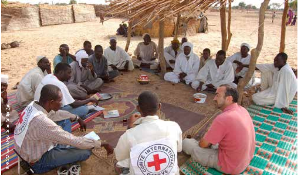
The ICRC talks with community leaders in Chad who have given shelter to displaced people about the distribution of agricultural equipment.

and taking their capacities and views into account in defining the ICRC's response.