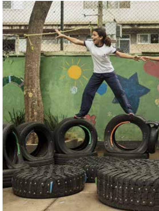
A 12-year-old Syrian refugee girl plays with her new Brazilian friends at school in Sao Paulo, Brazil.

The visas were thus a way to facilitate the arrival of Haitians in Brazil, an innovative measure for making it easier to reach a safer country. But once in the country they did not have guaranteed migration status. In light