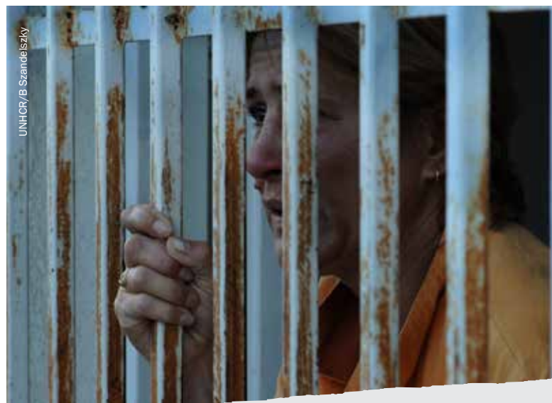
Asylum-seeking woman from Ukraine looking through the bars of the detention centre in Medvedov, Slovakia.