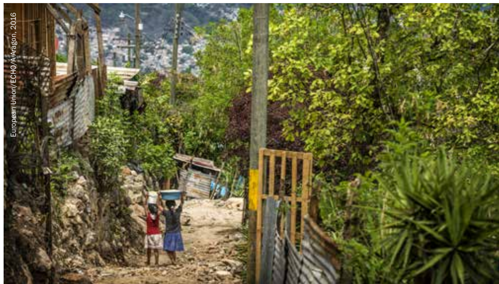
The Villa Cristiana neighbourhood of Tegucigalpa, Honduras, is controlled by the Mara 13 armed group, which does not allow children to attend school in the adjacent neighbourhood.