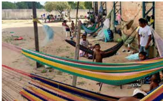
Members of the Warao indigenous community who have fled Venezuela sleep in hammocks outside a shelter in Boa Vista, Roraima, Brazil.