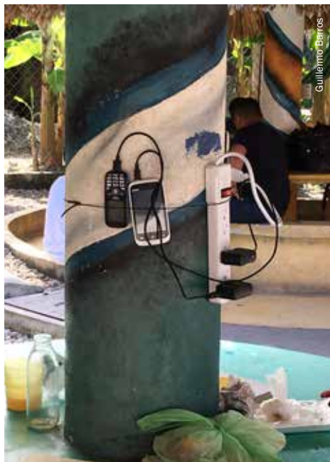
Mobile phones charging at a shelter for refugees and migrants.

For many of those travelling through Mexico, digital communication is seen as