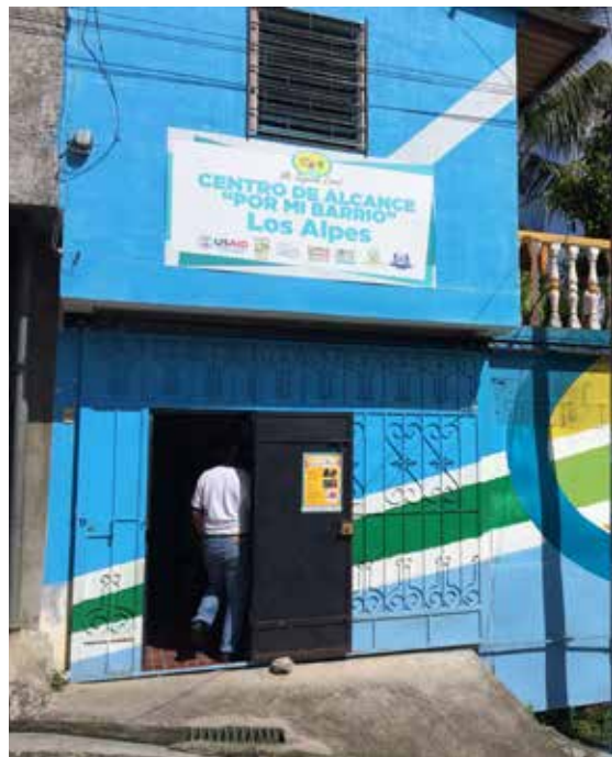
Youth Outreach Centre, El Salvador.

prevention. Strategically located in neighbourhoods with high levels of violence, the Centres – of which there are over 160 – aim to create a safe space where local youth can play, learn and develop. 4 Youth come to the Centres before or after school and receive homework help, play games, attend periodic workshops and engage in a range of other activities. Although a given Centre will serve hundreds of youth, the Centres themselves are not large; rather, the model is based on the idea that the Centre should function as a second home (their motto is mi segunda casa )