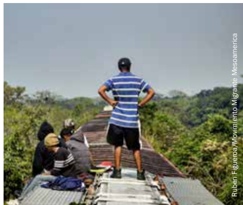
Rubén Figueroa/Movimiento Migrante Mesoamérica

Michoacán faces the additional challenge of attempting to assist and reintegrate thousands of migrants who return from the US because of unemployment or who are deported from the US due to criminal convictions or lack of documentation. Under the current presidential administration, the US Department of Homeland Security has successfully implemented a policy based on fear tactics to encourage thousands of undocumented immigrants to return voluntarily rather than risk mandatory custodial sentences if caught by Immigration and Customs Enforcement. These returnees sometimes attempt to settle in larger cities in Michoacán where they have social networks, in search of better employment opportunities. Others return to their home towns to live with relatives, where they frequently face scarce employment opportunities, an absence of