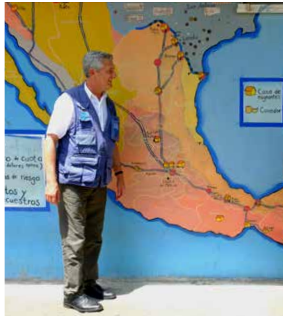
UN High Commissioner for Refugees Filippo Grandi visits the La 72 'Home and Refuge for Migrant People' shelter, Mexico, 2017. www.la72.org

A profound commitment to providing protection to those fleeing in search of safety is embedded in the values of Latin America and the Caribbean. There is a strong and great tradition of openness, solidarity and humanitarianism. History pays witness to