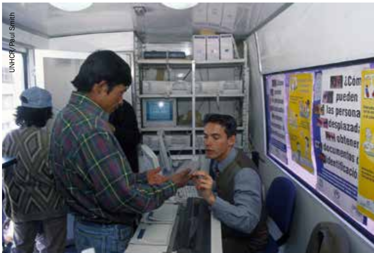
A mobile registration unit in Colombia issues ID cards to IDPs so that they can access government aid.

The government also needs to recognise – and legislate for – the scale of forced displacement associated with large-scale development projects, illicit economies (including illegal mining) and environmental impacts.