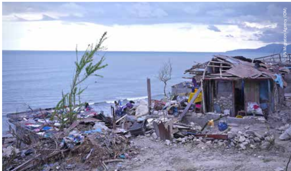
750,000 people in Haiti needed urgent humanitarian aid after Hurricane Matthew hit the country in October 2016.

number for Latin America and the Caribbean in 2016 is estimated to have been 1.8 million. 8 However, these numbers do not account for people moving due to slowly developing processes that have affected them over a long period of time. These forms of human mobility are hard to identify definitively and the lack of standardised data collection tools and vocabulary does not help either.