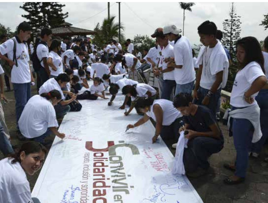
Colombian refugees and Ecuadorians nationals in Santo Domingo participating in an integration activity as part of a 'Living Together in Solidarity' campaign.

integration index. This, for example, can be through their inclusion in the Graduation Model, 3 which the Office in Ecuador has been implementing since 2016 with promising results, where participants are selected are selected based on, among other things, their household's score on the LII. The Graduation Model (or approach) comes from the world of development assistance and is aimed at 'graduating' people out of poverty. The model consists of a sequenced set of interventions that include consumption support, skills training, mentoring, financial training and inclusion in safety networks within the community. Ecuador is one of few countries applying the model in a refugee situation. Families 'graduate' according to their performance against four criteria, which in Ecuador are: eating at least three nutritious meals a day; having a family income above the poverty line; having 5% of