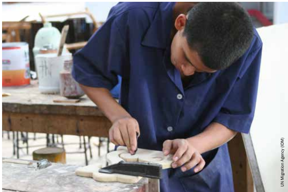
UN Migration Agency (IOM)

A vocational training project in Santiago de Cali, Colombia, supporting ex-combatant children.