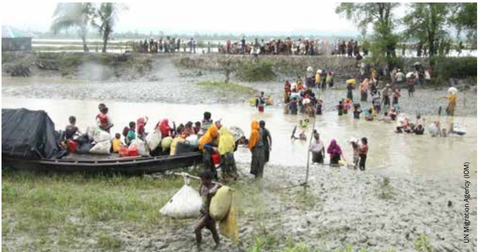
Rohingya refugees from Myanmar arriving in Cox's Bazar district, Bangladesh, September 2017.

A distinctive principle of the ASEAN Charter is that of "non-interference in the internal affairs of ASEAN Member States". 6 Despite this principle, due to increased tensions in the region following the 2015 Rohingya refugee crisis some Muslim-majority countries, such as Malaysia and Indonesia, began to take a stronger stance on the protection of the Rohingya Muslims. Although Indonesia had stated that the Rohingya crisis is a regional problem, it has followed the non-intervention principle, emphasising that it would pursue its policy of 'constructive engagement' rather than put pressure on Myanmar. Malaysia, on the other hand, was vocal in condemning Myanmar's