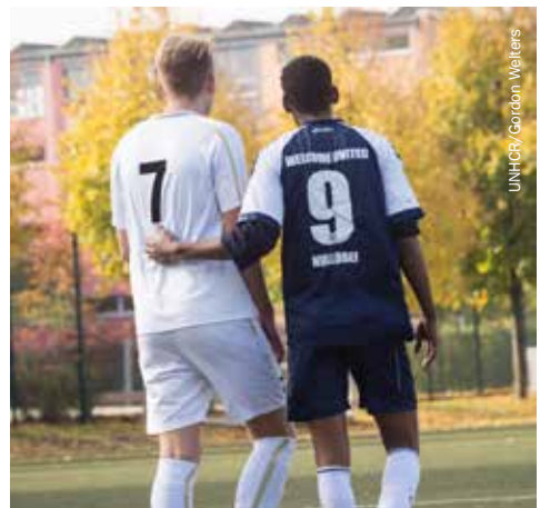
Football team SV Babelsberg 03 of Potsdam, Germany, formed a 'Welcome United' team for refugee footballers, who are now fully integrated members of the club, with the same rights and obligations.

1. A more detailed explanation of our research methods is available at http://fic.tufts.edu/research-item/refugees-in-towns/