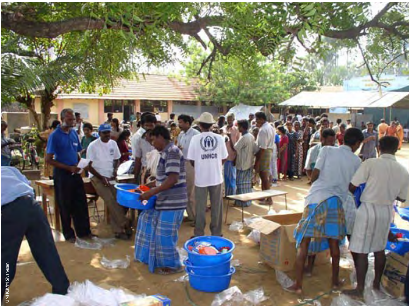
Distribution of supplies by UNHCR, Point Pedro district, Sri Lanka.

be completed in June 2005, with 2,442 transitional shelters in Ampara scheduled to be built by September 2005. The transitional shelters in Ampara (measuring 3 x 4 metres) comprise two partitioned rooms, are built within a galvanised iron frame and are compliant with the internationally-recognised SPHERE standards for a family of five. The brick foundation provides a firm impregnable base, with upper walls of plywood. The shelters can be disassembled and reassembled in another location if necessary. The roofs are made of zinc aluminium. Though more expensive than tin, it does not conduct as much heat, ensuring greater comfort for those living inside. The need to keep occupants cool is also recognised through the inclusion of a gap between the top of the outside walls and the zinc aluminium roof.