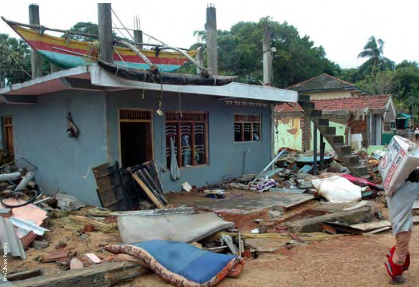
A man carries donated relief supplies past a destroyed home with a tsunami-thrown fishing boat on its roof, Hambantota, Sri Lanka.

cally available expertise. A standing global response mechanism under the auspices of the UN, with immediate authority to launch the initial response and build on available local and regional capacities, would lead to prompter dispatch of relief teams and supplies.