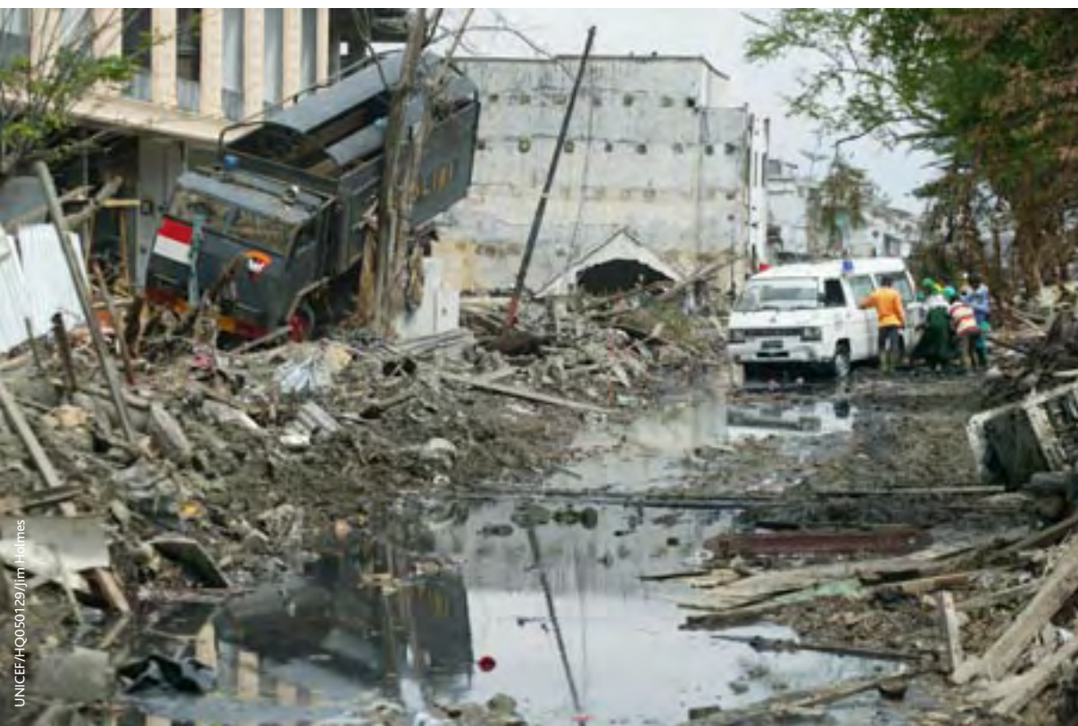
Street in the centre of Banda Aceh (some 4km from the coast).

However, in many areas, early recovery was not possible as damage to roads posed a problem for the early transportation and delivery of reconstruction materials. Improved arrangements with private contractors and standby partners with advanced logistical capabilities and air transport services would assist in overcoming these recovery difficulties.