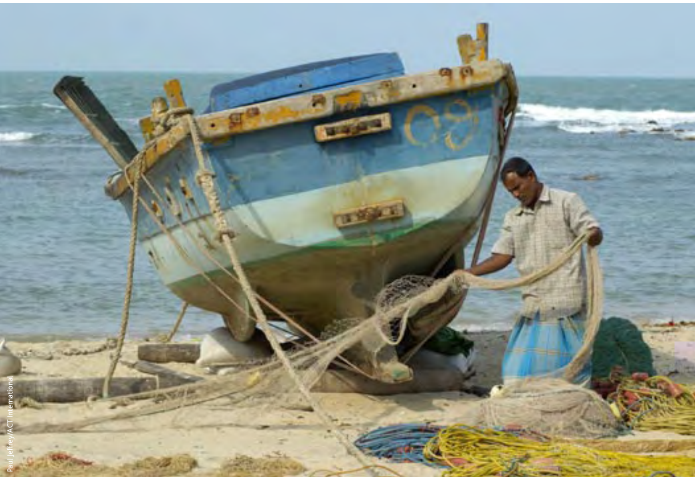
A fisherman inspects his net at Point Pedro, a village in the far north of Sri Lanka, near Jaffna.

ments (reducing vulnerabilities by establishing a physical buffer zone against future hazards), the inter-relation between property ownership and livelihoods appears to have been largely overlooked. Given the questionable legality of coastal tenures and the problem of making claims in the absence of title documentation, securing state compensation for lost property is likely to be a lengthy and complex process during which time livelihoods are effectively put on hold.