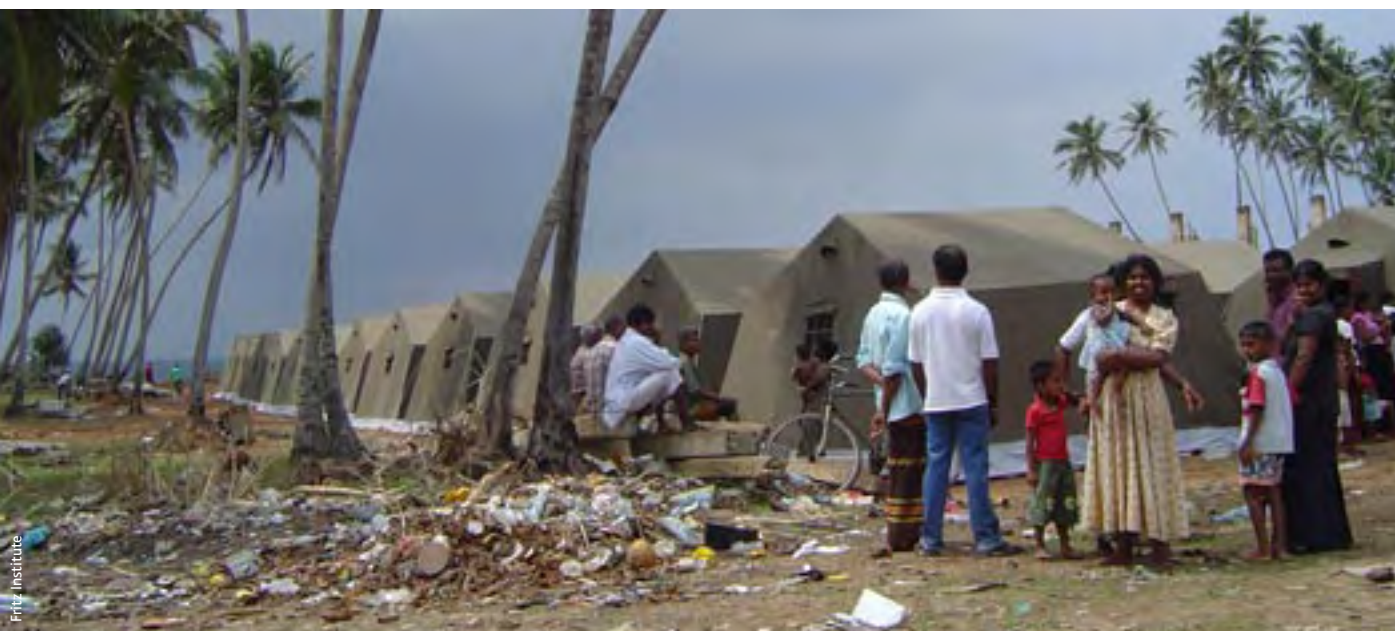
Temporary shelters, Sri Lanka.

The UN lacks system-wide mechanisms for incorporating risk reduction measures into post-disaster recovery efforts. There is a need to identify suitable assessment methodologies for identifying early recovery needs, to improve procedures for sending technical experts to support recovery programming and to ensure that funding for recovery and vulnerability reduction interventions is made available.